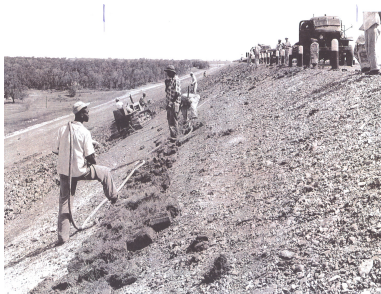
"Looking SE from a point 25 ft. downstream of Sta. 64 showing downstream slope sodding, mulching and fertilizing."