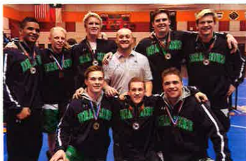
2016 State Team

WWW.SOUTHLAKEWRESTLINGCAMPS.COM DRAGON WRESTLING CAMPS